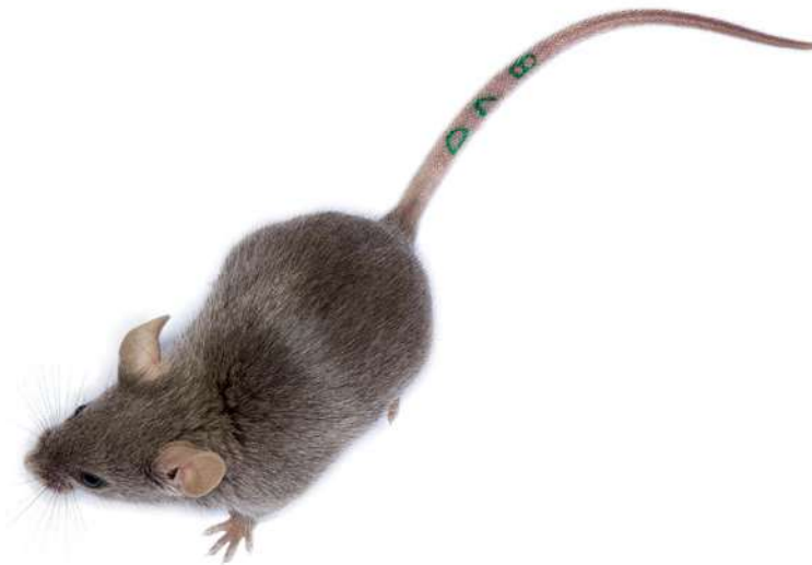
Mouse identified using the Labstamp® method.

† For dark pigmented mice, clients have the option to request UV green ink that fluoresces when a black light (provided) is applied to the tail.